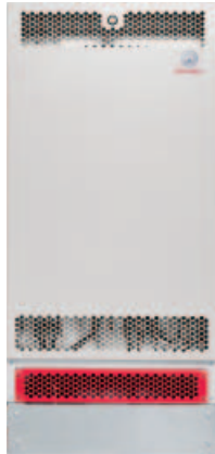
Schindler VF88 PF1

Schindler's PF1 compact, energy-efficient drive is available for AC geared and gearless configurations.